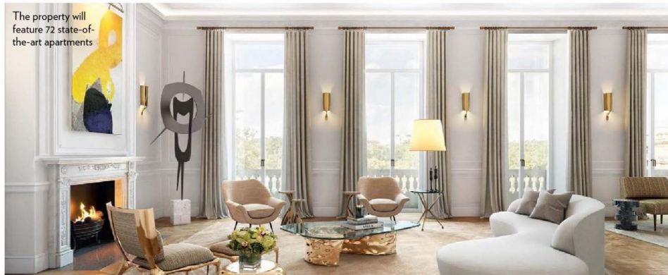
The property will feature 72 state-of-the-art apartments

If sharing a neighbourhood with the Queen of England is something you'd love to bring up in conversation, then No 1 Palace Street is where you should be looking. As the only residential property opposite Buckingham Palace, it holds a prolific history—it was built in 1861 as a hotel, and hosted Queen Victoria's guests. The property's 72 options range from one-bedroom apartments to penthouses, each unique in layout and custom-designed by Northacre's interior design division, N Studio. It also encompasses five iconic architectural styles that begin with 1860's Grade II Listed Italianate Renaissance and include 1880's French Renaissance, 1880's French Beaux Arts, 1890's Queen Anne and contemporary. Open to all residents is the over 10,000 sq-ft facility that includes personal training suites, treatment rooms and impressive private pools. Arguably the best residential location for anyone with a regal fascination, it is due for completion in 2020.