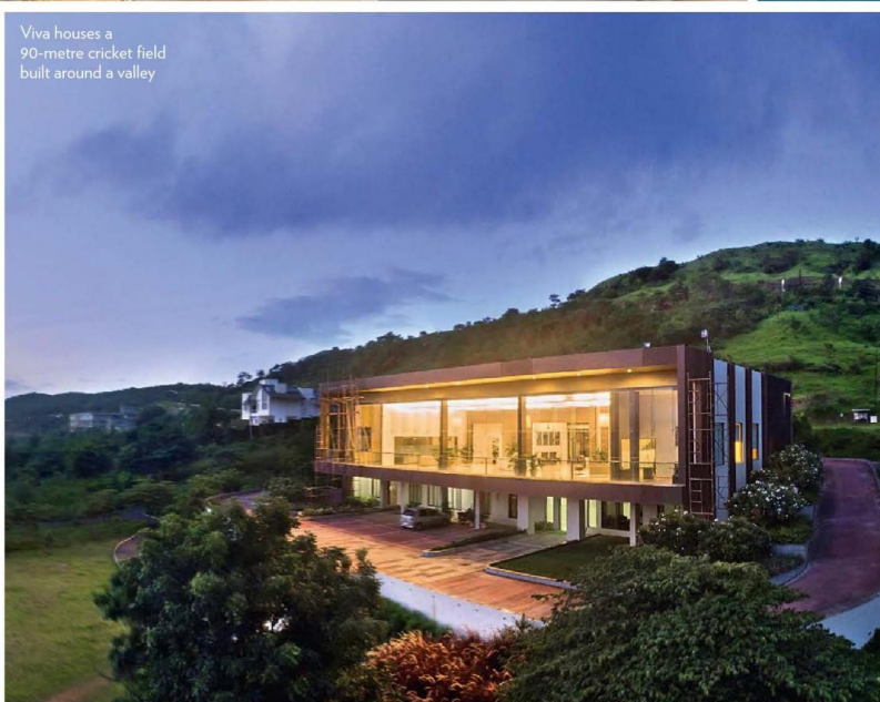
Viva houses a 90-metre cricket field built around a valley

Spread over 77 acres in Pirangut (10 km from Pune), with only four villas per acre, this property offers plenty of open space. And, making the most of this advantage is—wait for it—a cricket field, in what's a rarity for residential projects. Professionally managed and maintained at international standards, it comes complete with pavilion seating and a floodlit ground, giving teams the opportunity to play a proper one-day match, and allowing children to safely play late into the evenings. The serene neighbourhood encompasses independent bungalows, twin villas and town houses, as well as two well-equipped clubhouses spread over 40,000 sq ft and an organic farm. Conceptualised by Singapore-based Site Concepts, Viva reflects traits of Indo-Portuguese architecture. Plus, the gardens have been planted to ensure bloom and fruits throughout the year.